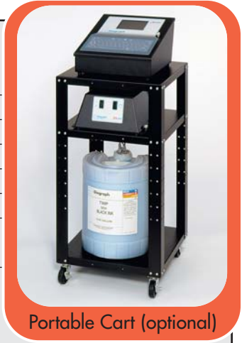
Portable Cart (optional)