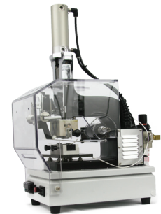
ATD - 106