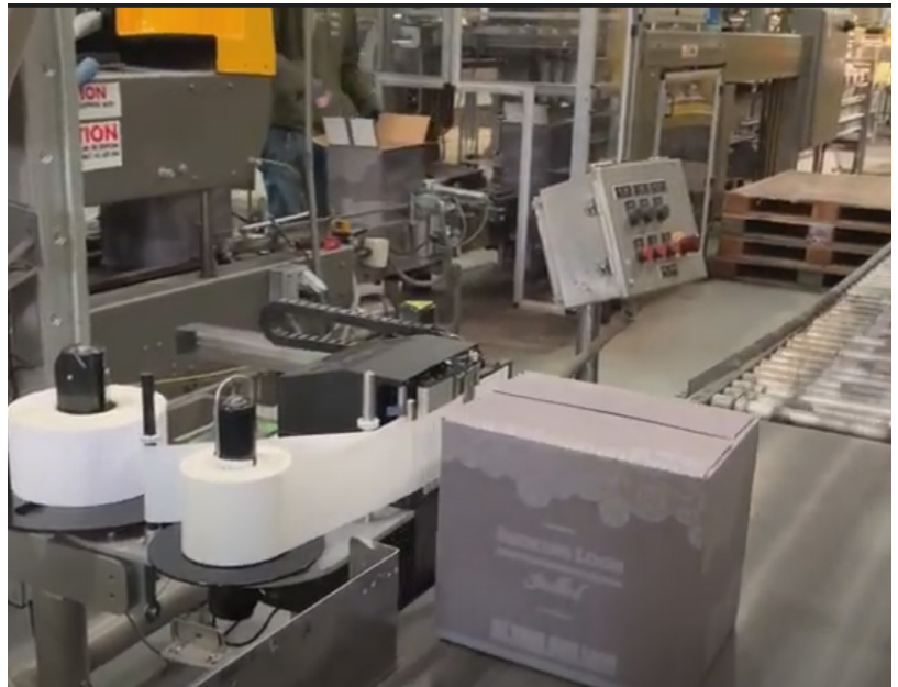
The Diagraph all-electric PA7100 applies labels to cases at Don Sebastiani & Sons

Ultimately, the use of smart sensors will prevent mismatched labeling sequences and ensures product to label matching.