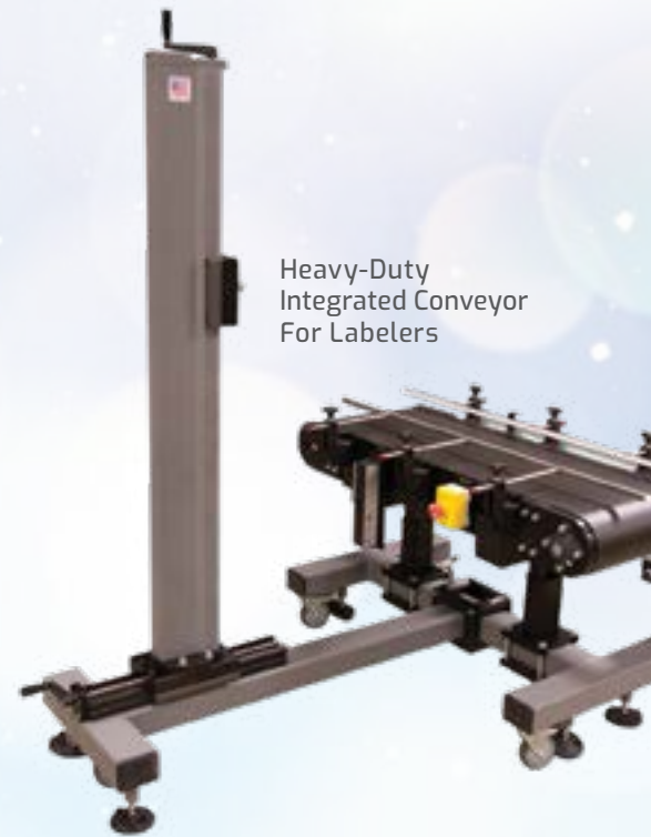
Heavy-Duty Integrated Conveyor For Labelers

*Based on recommendations only and may vary based on the application.